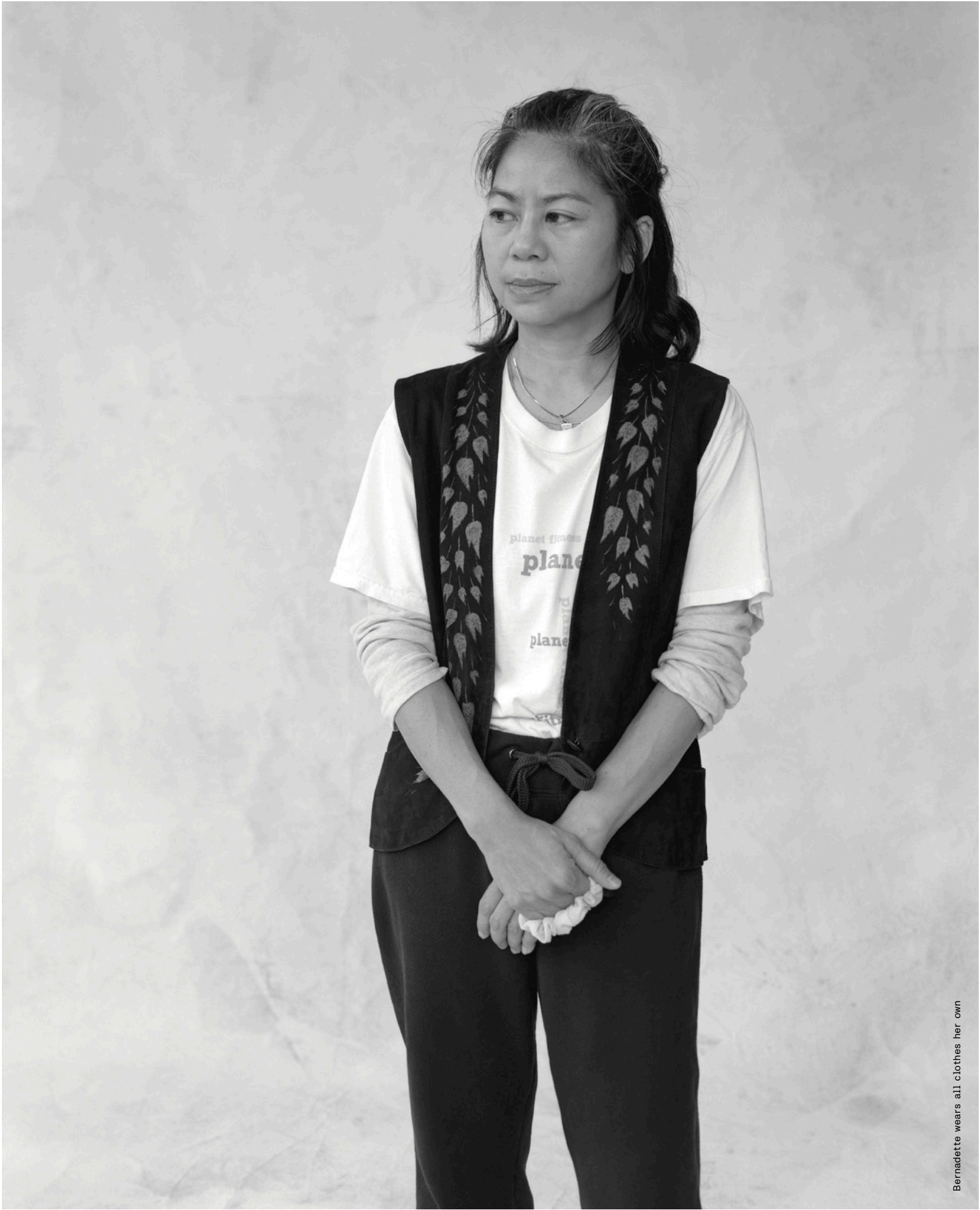
Bernadette wears all clothes her own